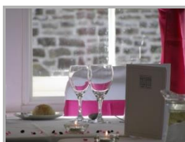
Conference & Events