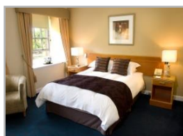
Special Accommodation Packages