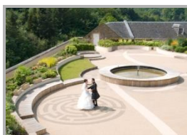
Weddings & Special Occasions

Mill One New Lanark ML11 9DB T: 01555 667 200 E: hotel@newlanark.org www.newlanarkmillhotel.co.uk